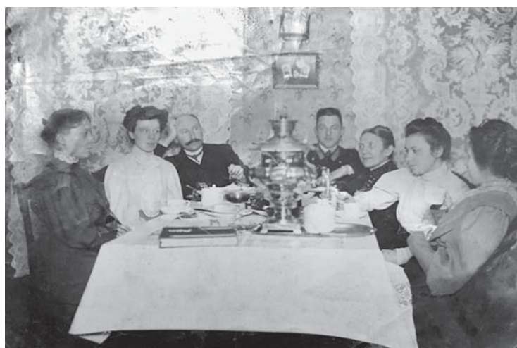
Fig. 2: N. A. Semashko and his relatives. 5

In 1898, after returning from exile, Semashko attempted unsuccessfully to return to IMU. In autumn 1899, he managed to get into the Faculty of Medicine at Kazan Imperial University, in the fourth year [6]. To do so, he had to sign an undertaking not to engage in revolutionary activities. Nevertheless, he was directly involved