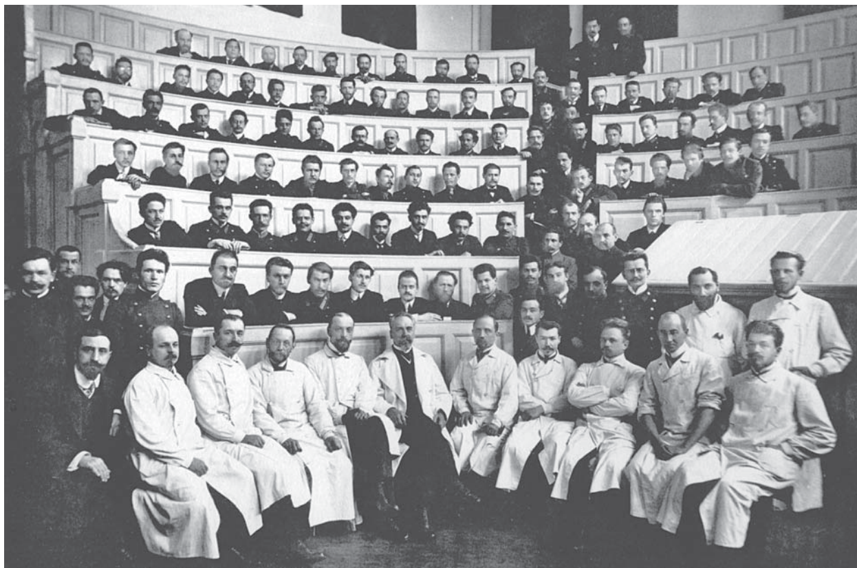
Fig. 3. Faculty therapy clinic (1910).