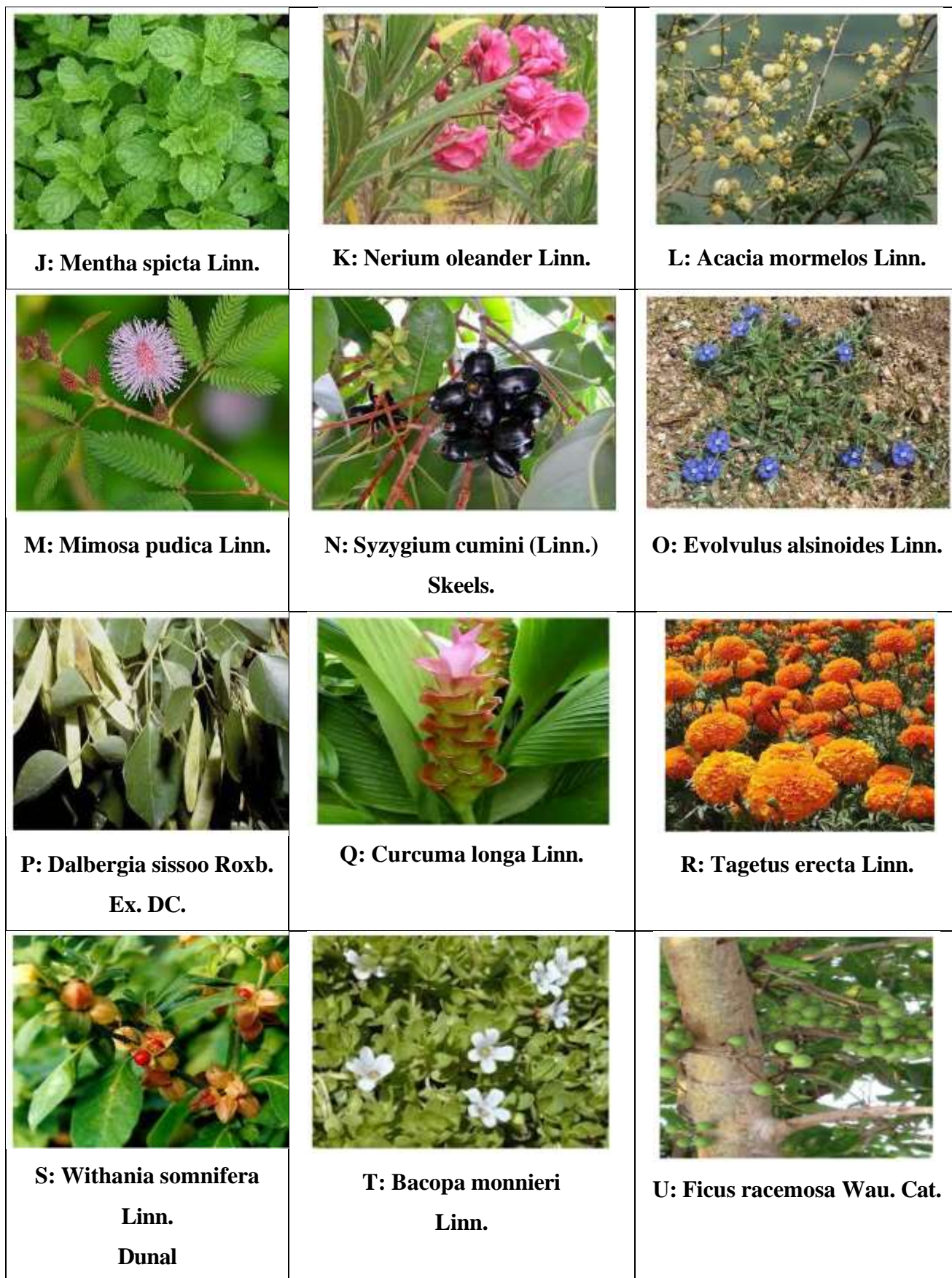
Fig. 1: Photographs of the traditionally used some Medicinal plants