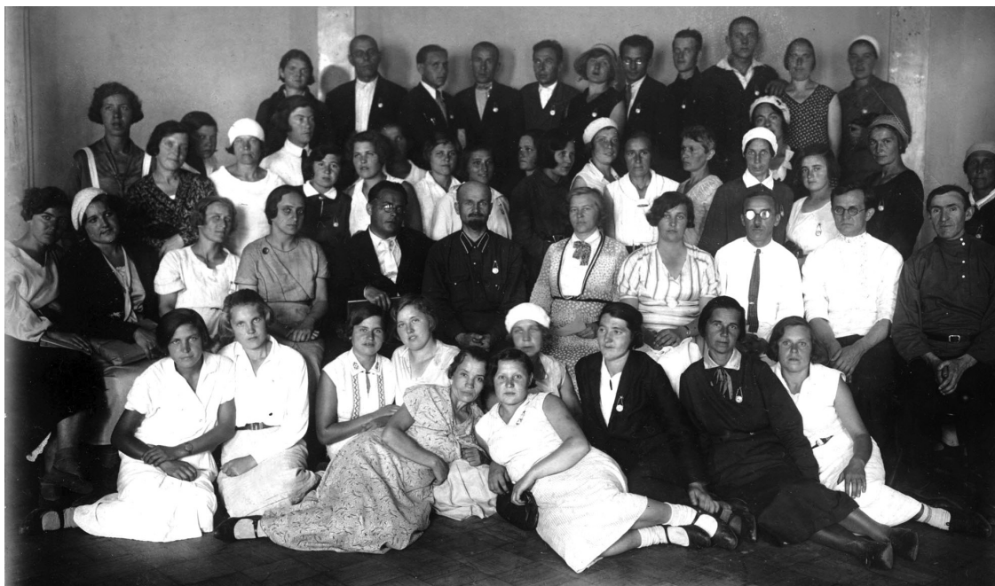
Fig. 2. Participants in the first courses for public health managers (1934).

to be carefully chosen, taking account of the audience and local epidemiological and public health situation. Learning about the principles of hygiene began from the pre-school age, when children were first introduced to the basics (the need to maintain cleanliness, wash hands, etc.). The teaching and involvement in various health measures continued in Pioneer organisations, at school, in the army (among both conscripts and the officer and command staff 28 ) and the workplace.