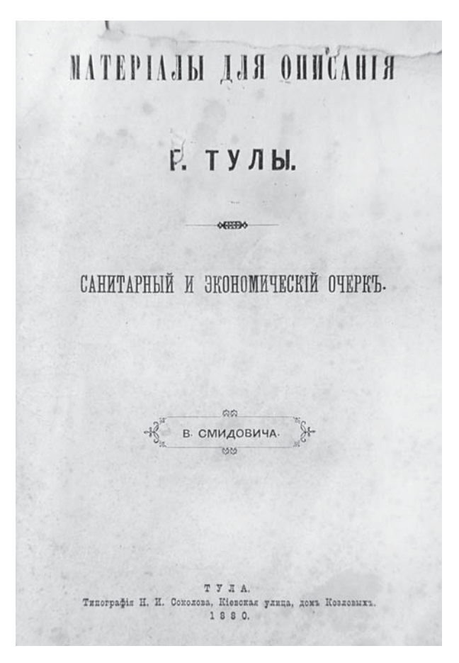
Fig. 2. Title page of V.I. Smidovich's book Materials for the description of Tula: health and economic essay (Tula, 1880).

Smidovich, understanding that the greatest efficiency and focus on the development of public health work requires a thorough study and comprehensive knowledge of the sanitary and economic situation of the city of Tula, created his own description: the essay includes 28 sections and is equipped with 22 tables, comprehensively characterizing the living conditions and state of health of all social groups of the population of Tula at the end of the 19th century [15] (Fig. 2). V.I. Smidovich also researched geographical factors (in the sections "Regional Topography" and "Soil Structure").