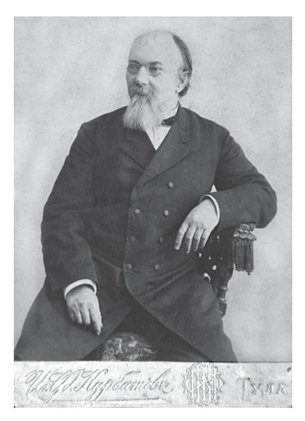
Fig.1. Portrait of V. I. Smidovich. Tula, 1890s.

In the unabridged history of the Society, as outlined in the report on the 25-year period on February 24, 1887, Smidovich emphasizes that in light of the "regrettable state of the city of Tula