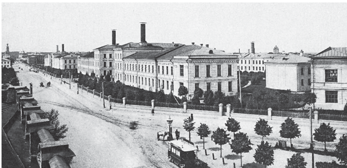
Fig. 3. The university clinics at Devichye Pole (view of Bolshaya Tsaritsynskaya street from the city center).