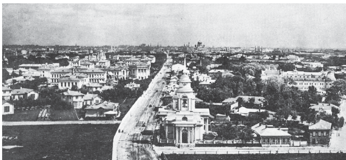
Fig. 4. General view of the clinical medicine campus at Devichye Pole from Novodevichy Convent.

Sklifosovsky did much to perpetuate the legacy of the great Pirogov. He initiated the honouring of Pirogov on the occasion of the 50th anniversary of his scientific activity in 1881. Sklifosovsky received permission from Emperor Alexander III