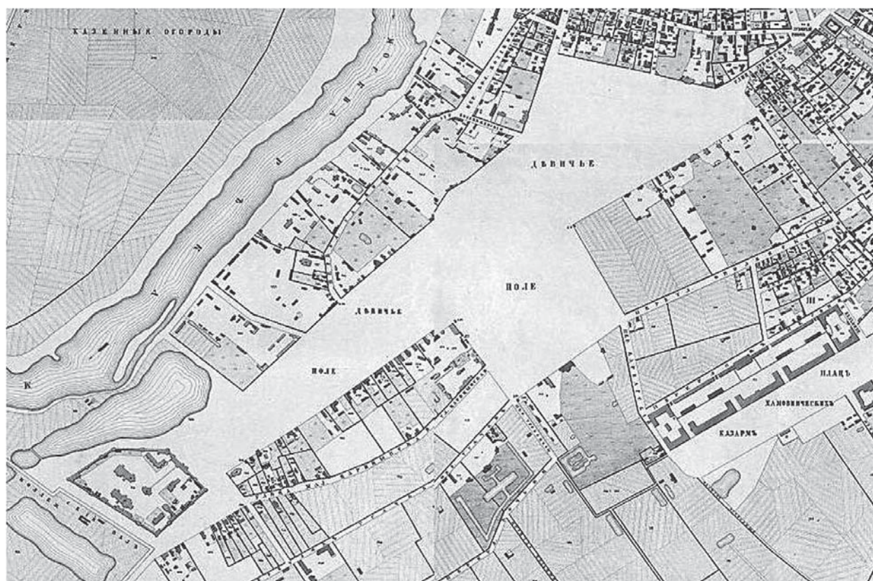
Fig. 2. Devichye Pole map.