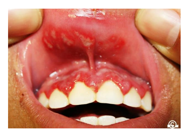
Fig 1. Primary Herpetic Gingivostomatitis

headaches. In the case of cervical lymphadenopathy, the vesicles and ulcers on the tonsils and posterior pharynx can resemble infectious mononucleosis or a streptococcal sore throat infection. Primary infection in an immunocompromised adult can be life threatening, with disseminated disease, or it may present with extensive nonhealing oral ulceration.<sup>1</sup>