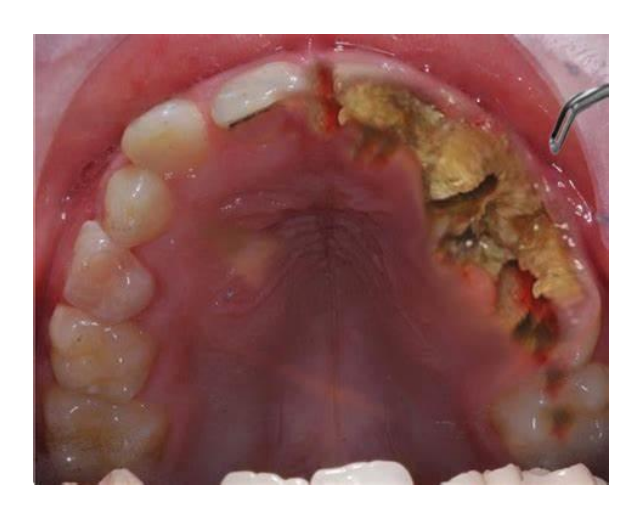
Fig 4. Unilateral necrosis of the mandible in HIV +ve patient

Spontaneous bone necrosis of the mandible, occurring during an acute attack of herpes zoster, has been seen in immunocompromised patients.<sup>5</sup> The patients present with the unilateral vesicles of herpes zoster, with subsequent unilateral exfoliation of the teeth in the necrotic mandible (see Figure 4).<sup>5</sup>