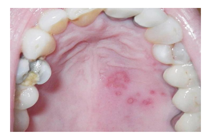
Fig 3 Herpes Zoster on the palate

Spontaneous bone necrosis of the mandible, occurring during an acute attack of herpes zoster, has been seen in immunocompromised patients.<sup>5</sup> The patients present with the unilateral vesicles of herpes zoster, with subsequent unilateral exfoliation of the teeth in the necrotic mandible (see Figure 4).<sup>5</sup>