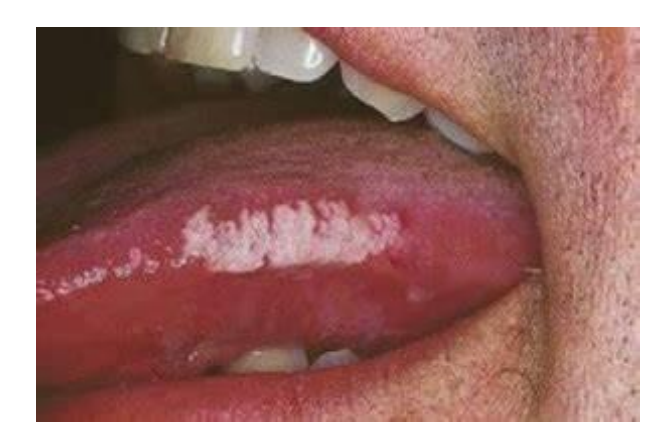
Fig 11. Oral hairy leukoplakia on the lateral border of the tongue

Barr virus and has no premalignant potential.<sup>8</sup> It has also been reported in HIV-negative personsin association with immunosuppresive therapy. It must be differentiated from chronic hyperplastic candidiasis or leukoplakia (a potentially malignant lesion). A biopsy must be performed to establish a reliable diagnosis. Once the diagnosis has been made, no treatment for the lesion is necessary.<sup>8</sup>