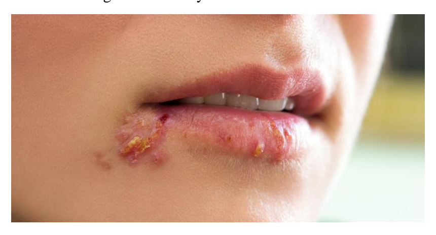
Fig 2. Herpes Labialis

Around 15 to 30% of the community is affected by episodes of secondary herpes simplex lesions (herpes labialis). Common colds, influenza, fever, UV exposure, menstruation, emotional upset, stress and anxiety predispose the patient to recurrent infection, as these cause reactivation of the virus, which subsequently migrates along one of the sensory divisions of the trigeminal nerve.<sup>2</sup> The lesions are most often seen at the mucocutaneous junction of the lip or peri-oral skin (see Figure 2). A burning sensation usually precedes the development of a small cluster of vesicles. These vesicles enlarge, coalesce, ulcerate and become crusted before healing within 10 days.<sup>2</sup>