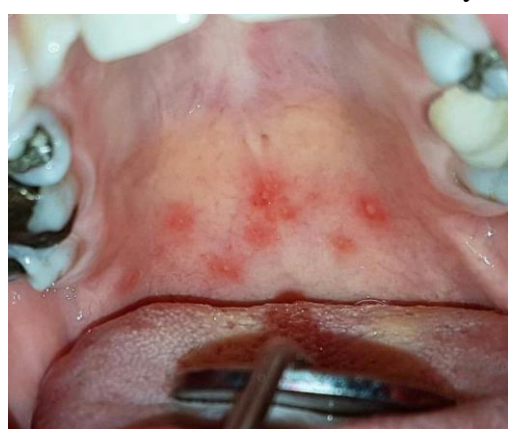
Fig 5. Herpangina on the palate

Herpangina affects children, mainly during summer, and is characterised by a sudden onset of malaise, fever and a sore throat. Patients present with vesicles, ulcerations, and diffuse erythema on the soft palate, fauces and tonsillar areas (see Figure 5). The systemic symptoms settle in two to three days and the ulcers heal in seven to ten days.<sup>6</sup>