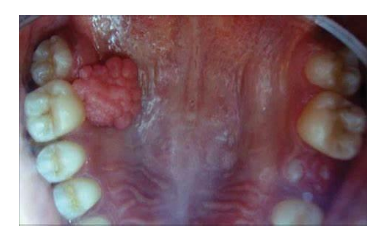
Fig 8. Squamous Papilloma

childhood infection.<sup>7</sup> Oral lesions usually arise from autoinoculation, most commonly on the labial mucosa, tongue and gingiva. It presents as a slow-growing, painless, exophytic lesion that consists of sharp, finger-like processes.<sup>7</sup>