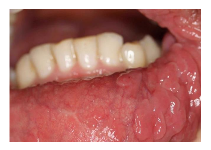
Fig 7 Focal epithelial hyperplasia

Heck's disease presents with multiple asymptomatic, slightly elevated, mucosa-coloured, smooth-surfaced nodules that occur on the labial or buccal mucosa gingivae or tongue of children (see Figure 7). Individual lesions tend to be small (0.3 to 1 cm), but they frequently cluster and coalesce, giving mucosa a cobblestone or fissured surface. Most lesions are found in children, although they occasionally can be found in older age groups. They usually regress spontaneously with age. <sup>7</sup>