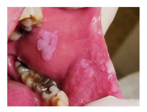
Fig 9. Condyloma Accuminatum

Condyloma accuminatum is usually present on the genitals, although it may be found in the oral cavity. Oral lesions are predominantly transmitted through oral-genital sexual contact. It consists of multiple cauliflower-like lesions, some of which are larger than 0.5 cm. They may become as large as 3 cm in size. The most common intra-oral sites are the labial mucosa and the lingual frenum and soft palate.<sup>7</sup>