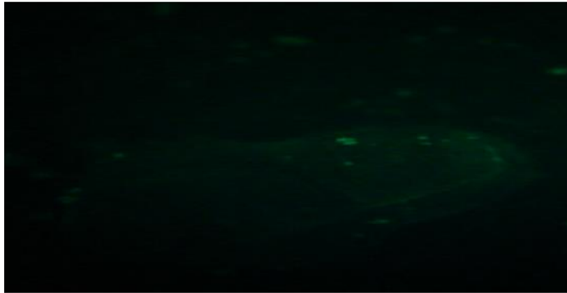
Figure (2): Negative case of crude hydatid cyst fluid slide of E.granulosus by IFA test (×40)